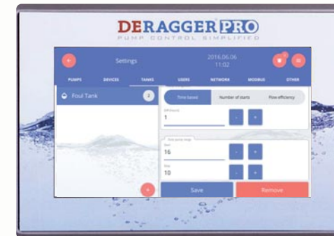
Tank Settings Screen