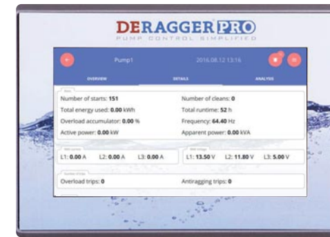
Pump Details Screen