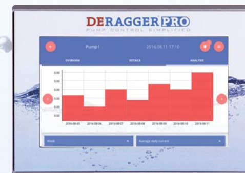
Pump Analysis Screen