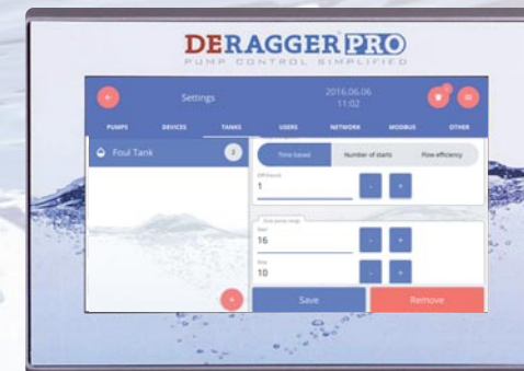
Pump Overview Screen