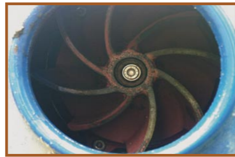
Rag-free pump impeller after 2 months of DERAGGER + anti-ragging device operation.