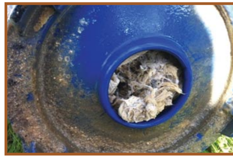
Ragged pump before installation of DERAGGER + anti-ragging device.

By maintaining a clean impeller at all times, the low voltage DERAGGER + anti-ragging device releases you from the time-consuming and costly necessity of manually lifting pumps – thus eliminating downtime and other costs associated with pump blockages. Reduced environmental incidents, together with less electricity consumption, result in a lowered carbon footprint.