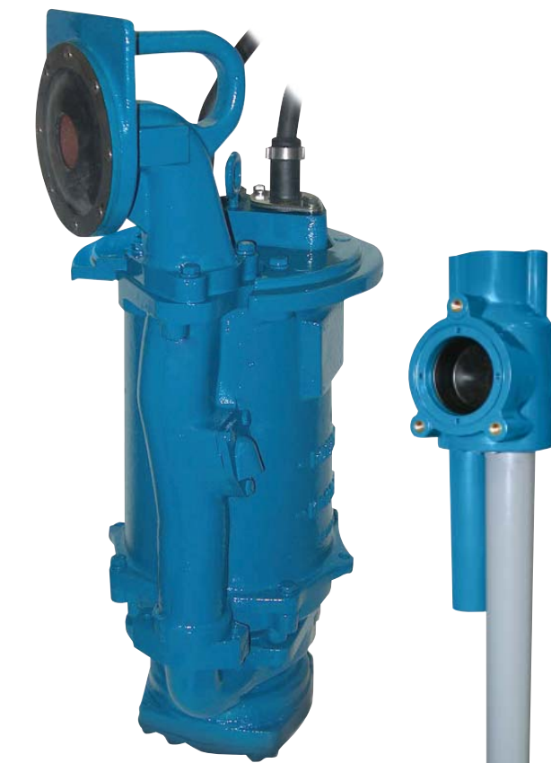
Omni Grind Plus™